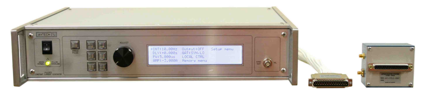
AV-107C-B, shown with the supplied accessories (AV-CLZ1-100 cable and AV-CTL1-ENC test load).

Please note that the combination of high currents and fast rise times makes the AV-107 series intolerant of even very small parasitic inductances. For tests involving probing stations or long cable runs, it may be more advisable to use a high-voltage 50 Ohm pulser (with 50 Ohms added in series with the device under test), such as the AV-1011, AVR-3, AVR-4, AVR-5B, AVR-7B, and AVR-8A families. In many cases, this approach will provide better waveforms, particularly if the load impedance is reasonably well defined (or << 50Ω). Avtech's knowledgeable applications engineers can suggest an appropriate approach for your application. Email us <a href="mailto:info@avtechpulse.com">info@avtechpulse.com</a> for more information!